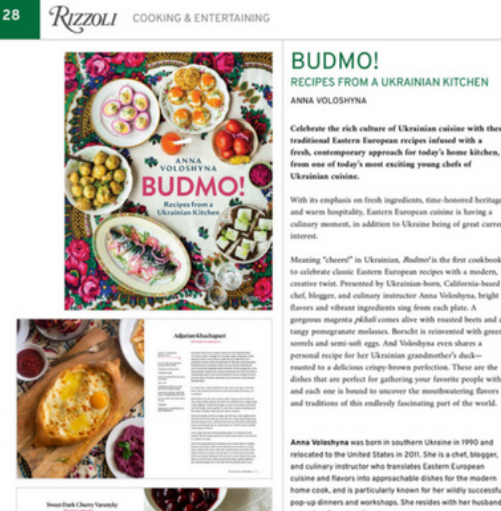
ECIPES FROM A UKRAINIAN KITCHEN

Celebrate the rich culture of Ukrainian cuisine with these traditional Eastern European recipes infused with a fresh, contemporary approach for today's home kitchen, from one of today's most exciting young chefs of